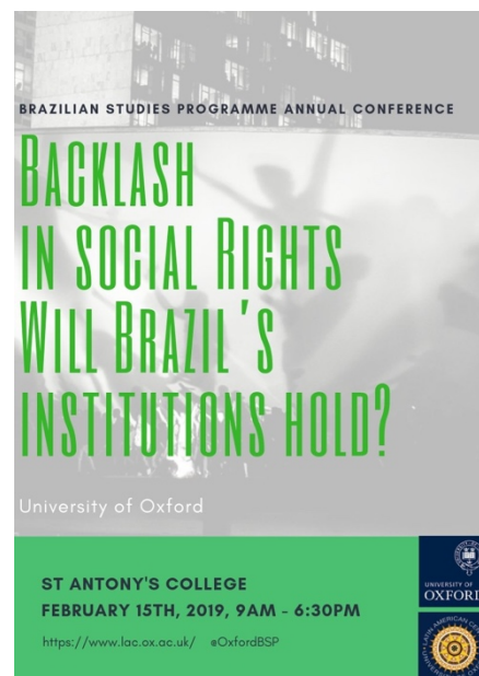
Posters BSP annual conferences